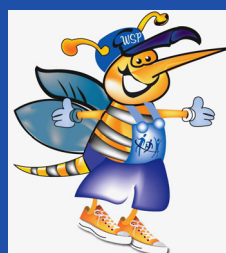
Programme Mascot 'Wizzy the Wasp'

Our thanks again to the pilot schools; Scoil Mhuire, Abbeyside; Garranbane N.S., St. Mary's, Dungarvan; Knockanore N.S.; Fenor N.S.; St. Saviours, Ballybeg Waterpark N.S.